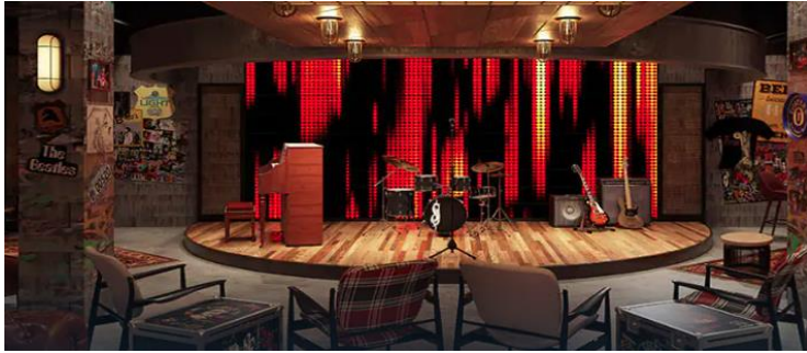
Sid Norman's Pour House