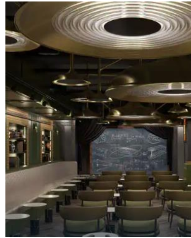
The Improv At Sea