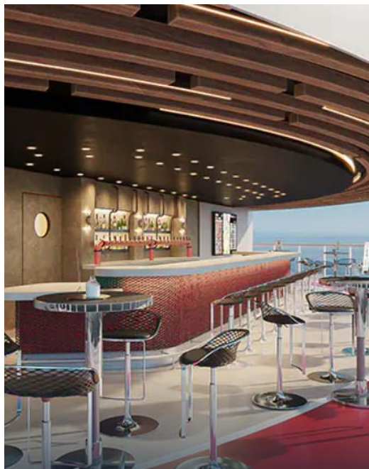
Prima Speedway Bar